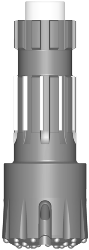
RC100 Bit Shank