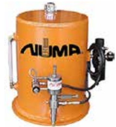
15 Gallon Lubricator