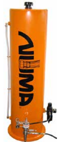
45 Gallon Lubricator