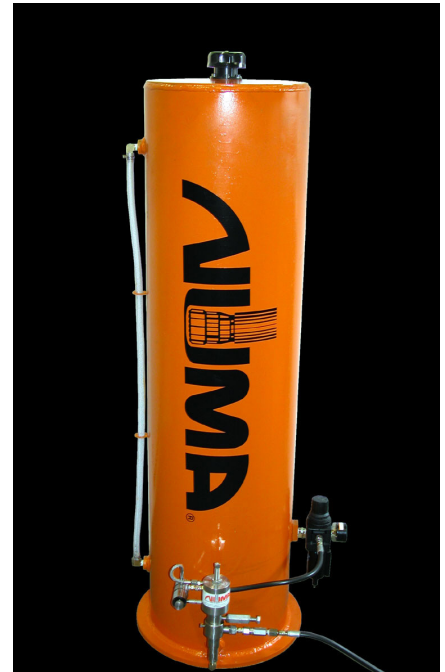
“45 Gallon Lubricator”