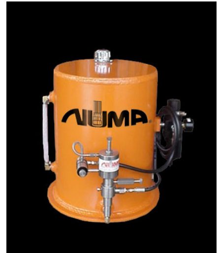
“15 Gallon Lubricator”